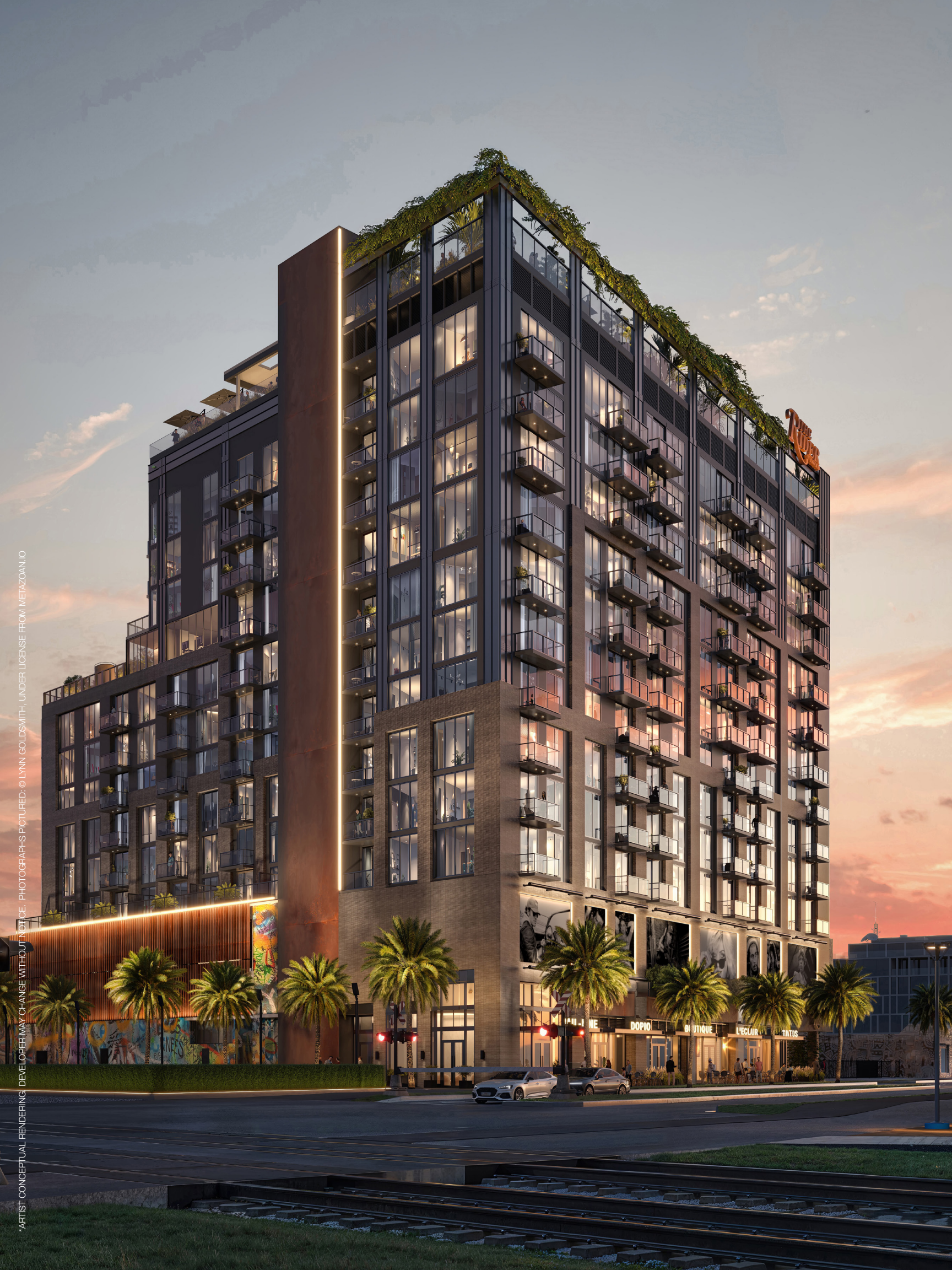
*ARTIST CONCEPTUAL RENDERING. DEVELOPER MAY CHANGE WITHOUT NOTICE.