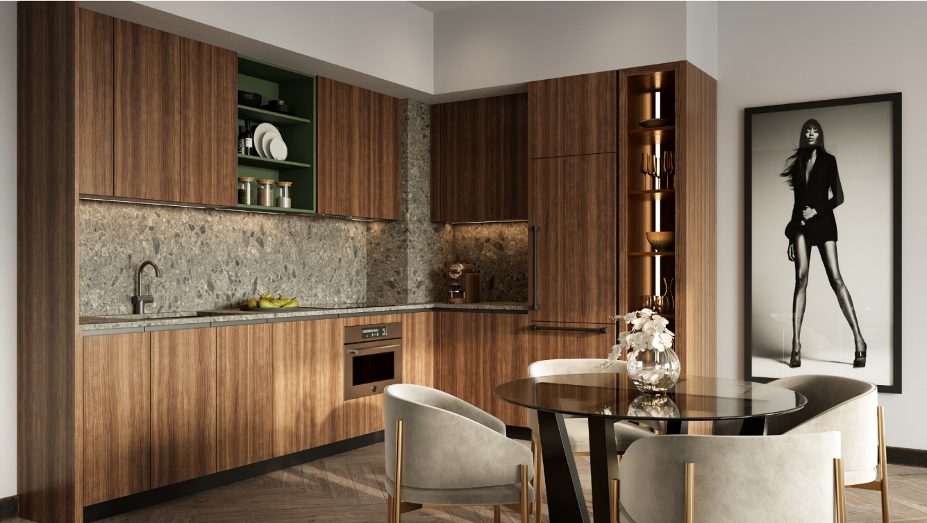
*ARTIST CONCEPTUAL RENDERING. DEVELOPER MAY CHANGE WITHOUT NOTICE.

The beating heart of Miami's cultural revolution is now at the center of The Rider. These bold new residences are perfectly nestled between Miami Midtown, East Edgewater, Design District and Wynwood. Like never before, residences here exemplify artful living and make authenticity and style one.