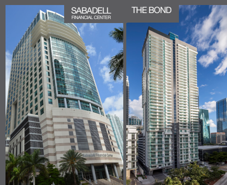
SABADELL FINANCIAL CENTER