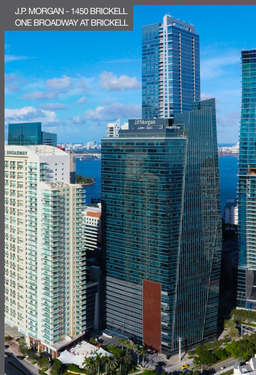
J.P. MORGAN - 1450 BRICKELL ONE BROADWAY AT BRICKELL