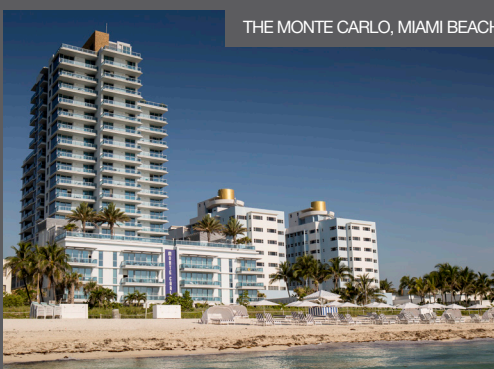
THE MONTE CARLO, MIAMI BEACH